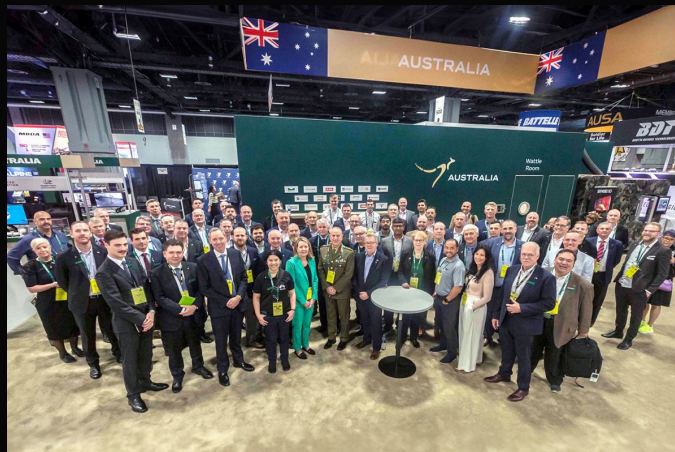
Poland International Defence Industry Exhibition (MSPO) Location: Kielce, Poland