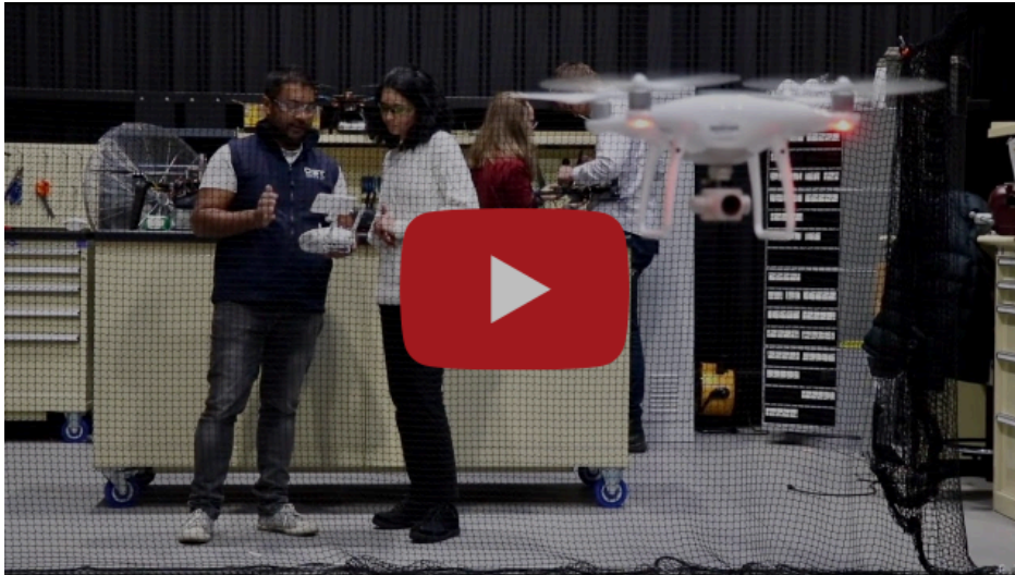
Prof Tanya Monro | STEM Professionals Making a Difference | DSTG NAVIGATE

Applications are now open for the 2025 DSTG NAVIGATE Program, closing 14 April 2025 .